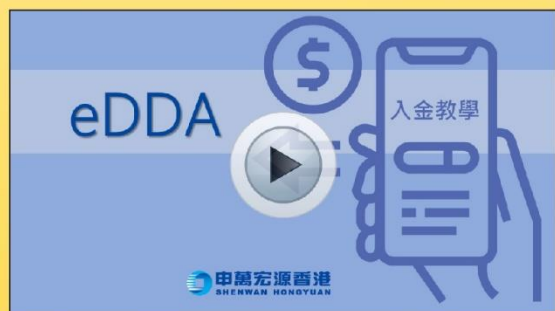
eDDA Fast Deposit Service Video

In order to help you get started more quickly, we have carefully prepared instruction videos (Only Chinese Version):